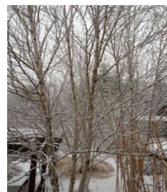
Pre-Christmas snow on the Coyle.