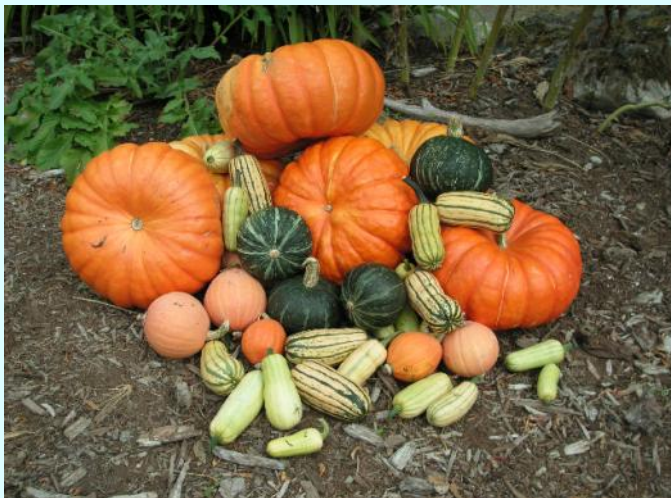
Below: Winter squash harvest