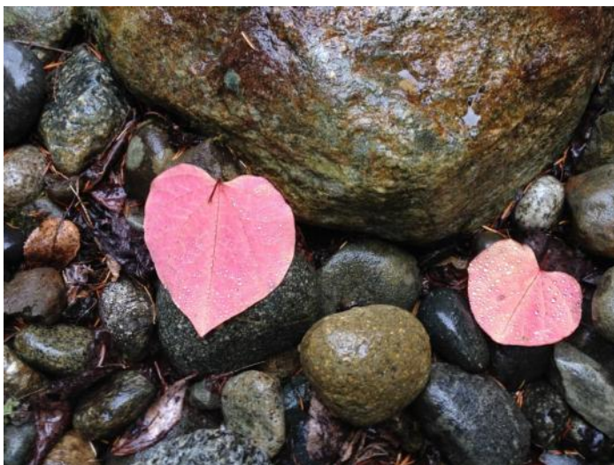
Fallen Redbud leaves submitted by: Kris Burns.