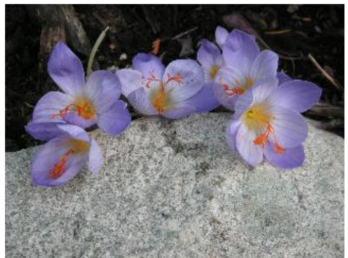
Autumn crocuses submitted by: Erica Iseminger.